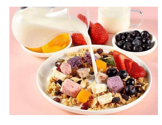
Grain flaking solution